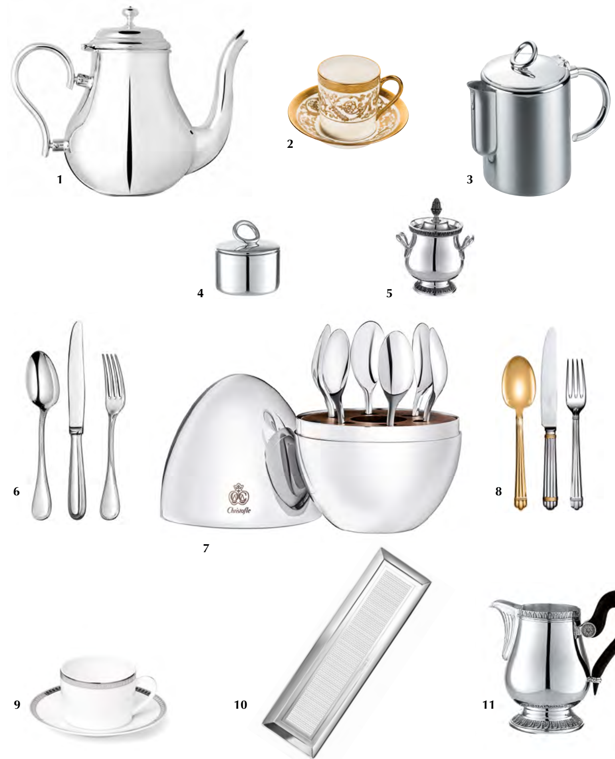
1. Albi Individual Tea pot 2. Orangerie Coffee cup and saucer 3. Vertigo Hot beverage server 4. Vertigo Sugar bowl 5. Malmaison Sugar bowl 6. Perles Flatware 7. Mood Coffee Flatware 8. Aria Flatware 9. Malmaison Teacup and saucer 10. Malmaison 6 Tray 11. Malmaison Cream pitcher