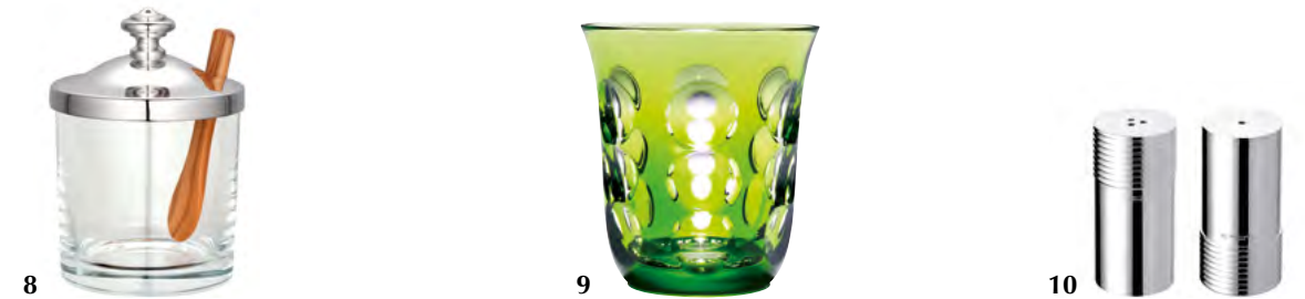
1. Silver Time Bread basket 2. Galet Chopsticks 3. Vertigo Knife rest 4. Graphik Red wine glass 5. Mood Flatware 6. K+T Champagne cooler 7. Perles Flatware 8. Albi Mustard/Jam pot 9. Kawali Anis green goblet 10. K+T Salt and pepper