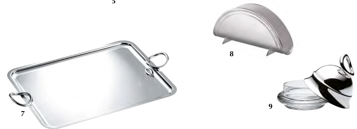
1. Jardin d'Eden Medium 3-tier pastry stand 2. Graphik Blue flute 3. Malmaison Punch bowl 4. Rubans Flatware 5. MOOD Party Flatware 6. Spartours Flatware 7. Vertigo Rectangular tray with handles 8. Albi Napkin holder 9. Vertigo Individual butter dish